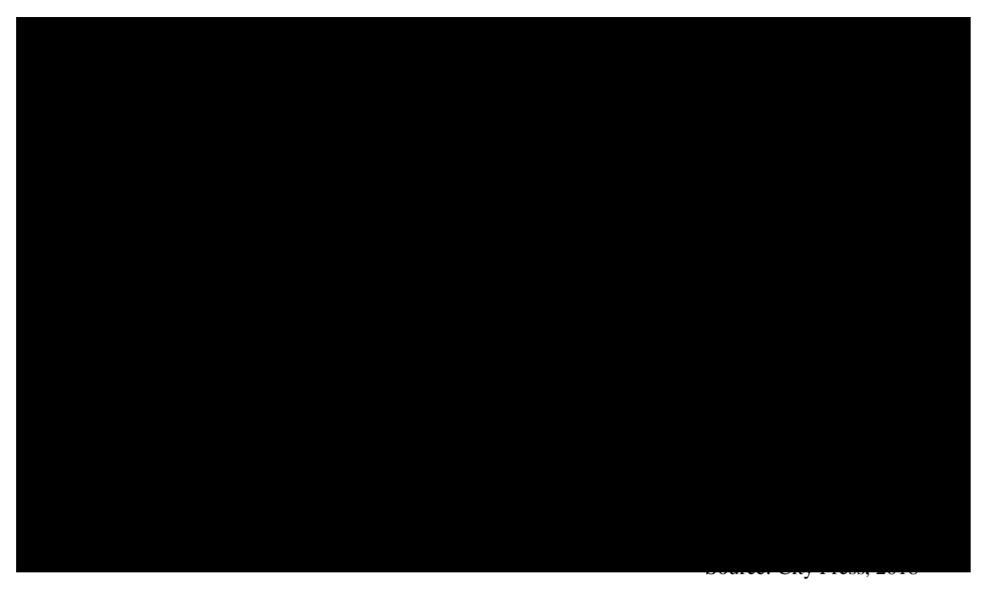
Table 2: The number of initiates who have suffered and died in the past 10 years in the Eastern Cape.